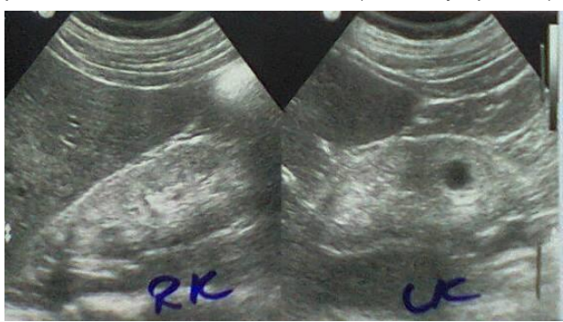
Fig 1: Renal ultrasound confirmed the chronicity of renal failure and showed small kidneys

Renal ultrasound (Figure-1) confirmed the chronicity of renal failure and showed small kidneys (RK: 8 x 4, cortex 6 mm, LK: 8.2 x 4, cortex 6 mm). The kidneys had hyper-echoic texture with reduced cortical thickness and loss of the cortico-medullary differentiation. There were small cysts on both kidneys, not more than 1, 5 cm in diameter. Abdominal ultrasound also showed small polyp in the gall bladder (Figure-2) and mild enlargement of the prostate with a volume of 27 cm3 (Normally up to 25).