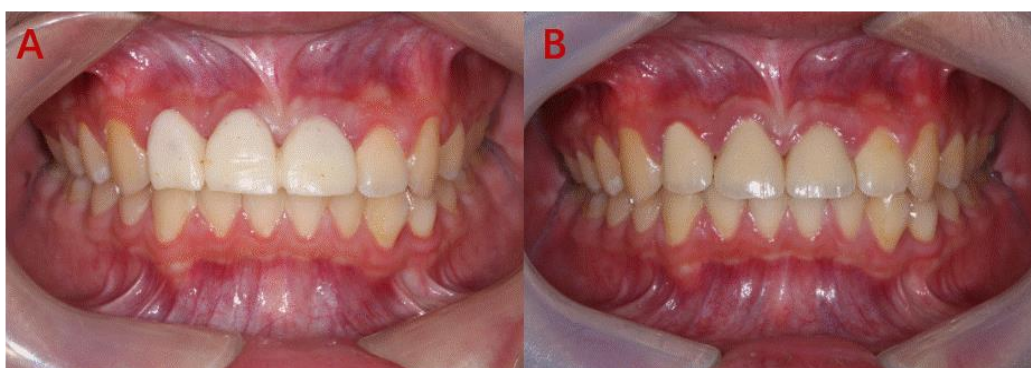
Fig3 A : The temporary crown was used for 6 months ; B : the ceramic crown was cemented on 12 11 and 21