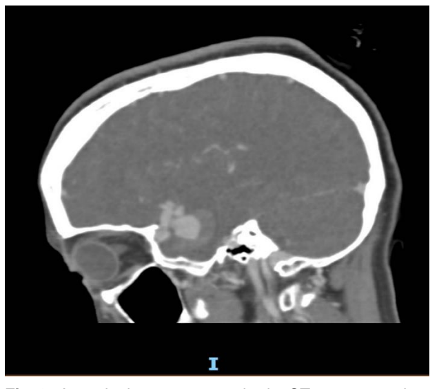
Fig 6: A sagittal post-contrast brain CT scan reveals a dilated MCA and filled aneurysm. The aneurysm appears to be arising from the bifurcation of the MCA.