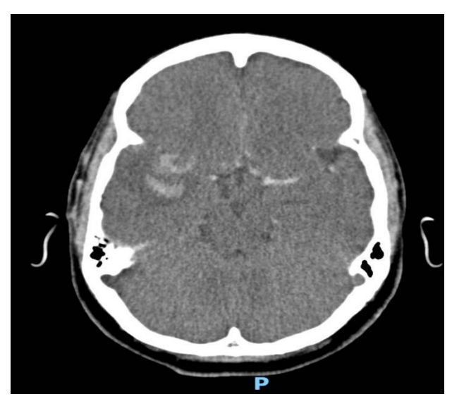
Fig 3: An axial post-contrast brain CT scan reveals a dilated right MCA and filled aneurysm with a hypodense part, which confirms the berry aneurysm diagnosis.