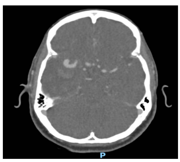
Fig 4: An axial post-contrast brain CT scan reveals a dilated right MCA and it shows that the aneurysm starts from the bifurcation of the MCA.