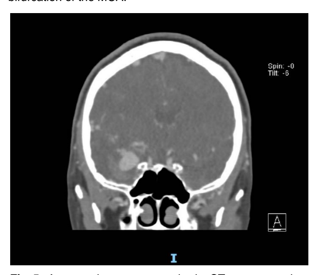
Fig 5: A coronal post-contrast brain CT scan reveals a dilated MCA and filled aneurysm.