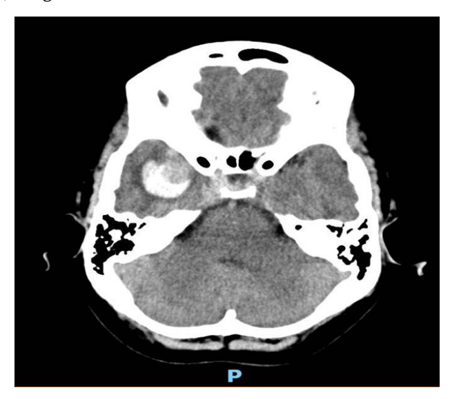
Fig 1: An axial plain brain CT scan reveals a right temporal lobe hematoma.